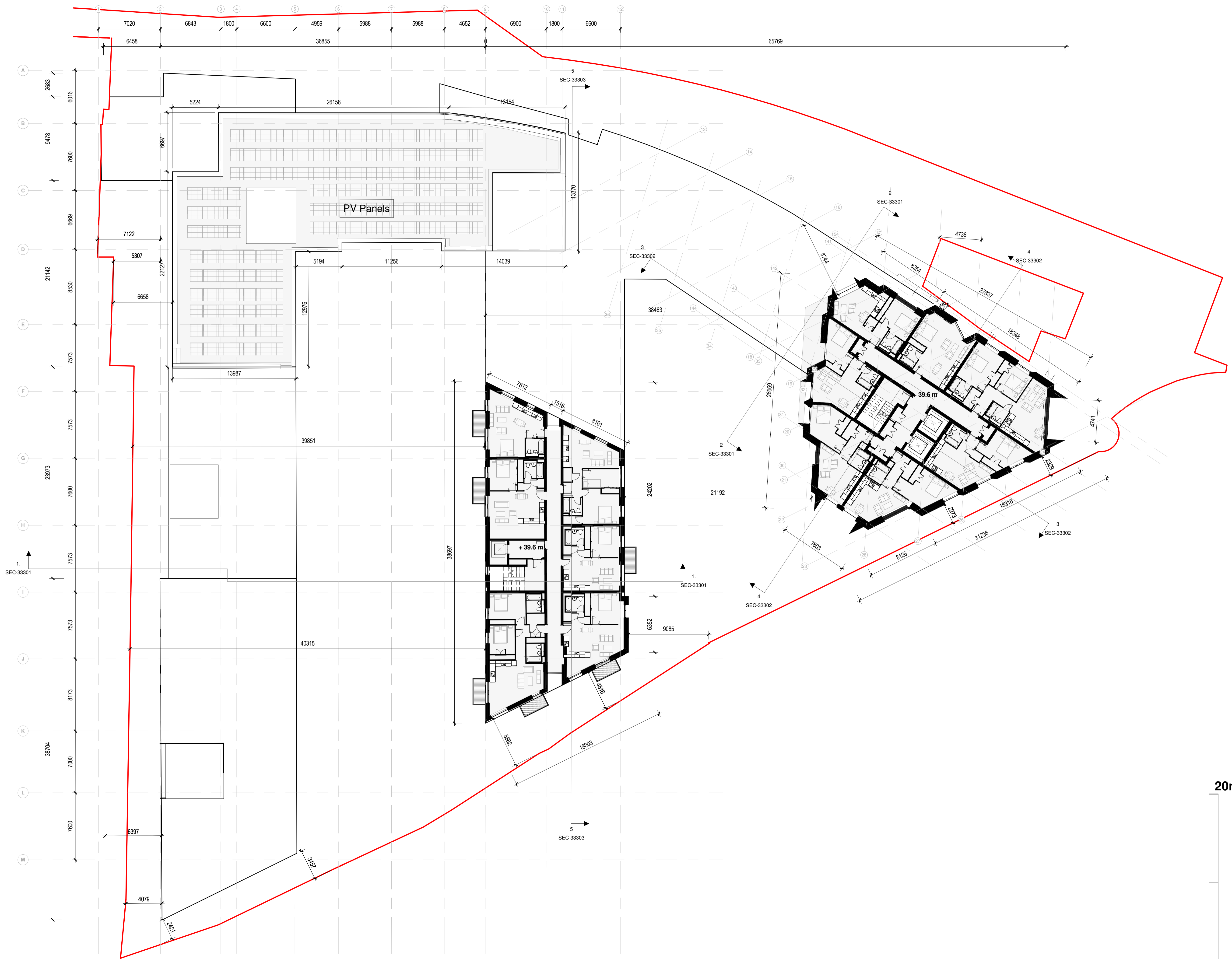
Proposed 10th Floor Plan 1 : 200

Notes: DO NOT SCALE FROM THIS DRAWING. USE FIGURED DIMENSIONS IN ALL CASES. VERIFY DIMENSIONS ON SITE AND REPORT ANY DISCREPANCIES TO THE ARCHITECTS IMMEDIATELY. THIS DRAWING TO BE READ IN CONJUNCTION WITH THE ARCHITECTS SPECIFICATION. © THIS DRAWING IS COPYRIGHT AND MAY ONLY BE REPRODUCED WITH THE ARCHITECTS PERMISSION.